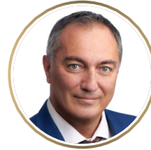
ALEXANDER DOBRINOV CITIZENSHIP AND INVESTMENT LTD