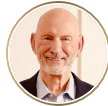
JAMES CLIFTON STERLING MULTI-FAMILY COMPANY