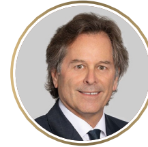
STEPHEN GREEN GREEN AND SPIEGEL LLP