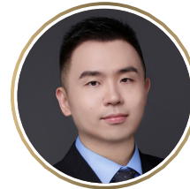
OLIVER YANG REID & WISE, LLC