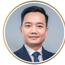
VINH DANG KHAI PHU INVESTMENTS & MIGRATION